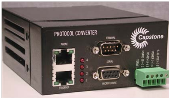
Figure 20-1. Capstone Protocol Converter

The Capstone Protocol Converter (CPC-100) provides the ability to use the standard Capstone MicroTurbine commands over a TCP/IP network connection, or over a local or wide area network. See Figure 20-1.